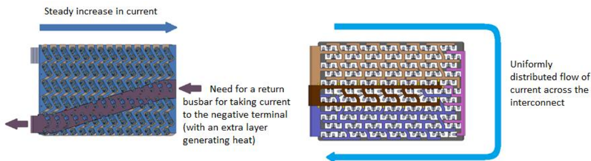
Figure 3: Comparison between the current dispersion in a conventional EV interconnect and one using U-Turn technology

An inability to remove heat effectively will put more acute strain on the battery cells, accelerating how soon they reach an end-of-life situation. Although other interconnection solutions can potentially get around the heat issue by adding extra insulation, that will only add to the BoM costs. Otherwise the only other thermal management option will be to accentuate the cooling system. This could either be done by specifying a larger cooling system, that takes up space, or run it with more power. Either way more electricity will be drawn - which would mean less battery charge is available for propulsion (and less range can be covered by the vehicle).